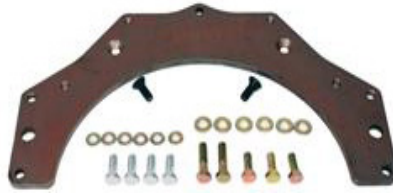
sample transmission adapter plate.